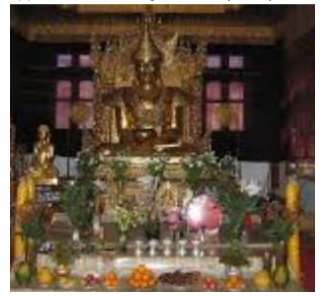
(b).Bamboo Buddha image in Kalaw Myanmar Figure 1.Buddha images made from bamboo